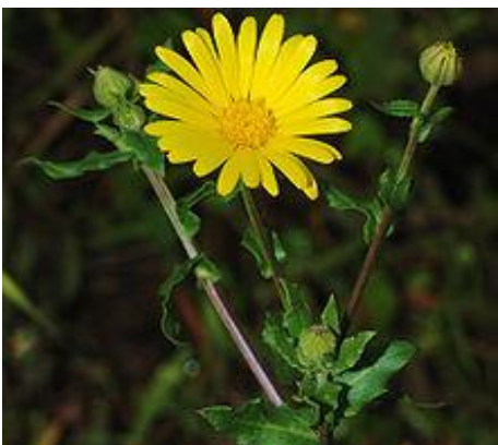
Calendula arvensis Calendula