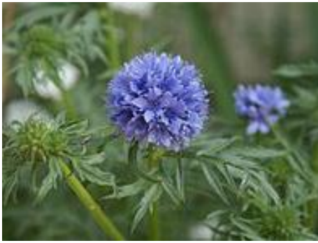
Gilia capitata Blue field gilia