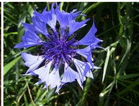
Centaurea cyanus Cornflower