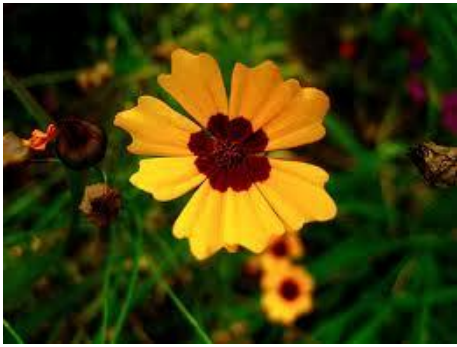
Coreopsis basalis Golden Mane