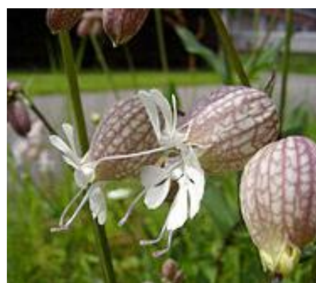
Silene vulgaris Catchfly