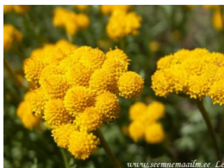
Lomas inodora Yellow ageratum