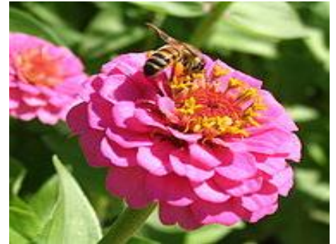
Zinnia elegans Zinnia