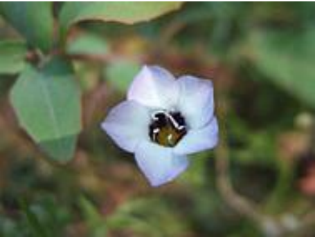
Gilia tricolor Birds eye gilia