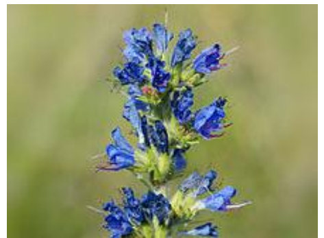
Echium vulgare Viper's bugloss