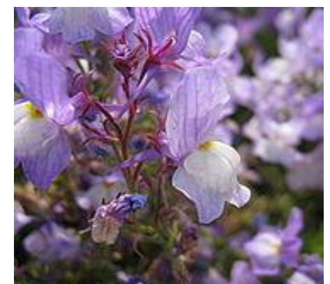
Linaria maroccana Spurred snapdragon