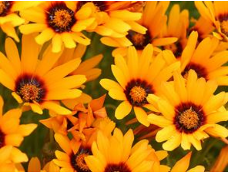
Ursinia anethoides Ursinia