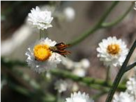
Ammobium alatum Winged everlasting