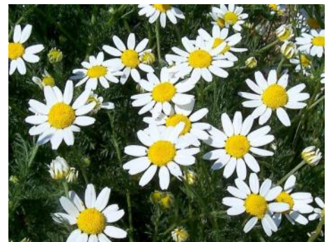
Anthemis Arvensis Corn Chamomile