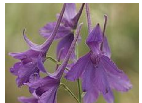
Consolida regalis Forking larkspur