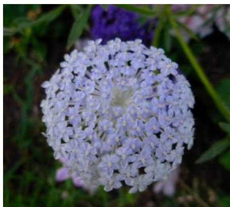
Didiscus caerulea Silver scabious