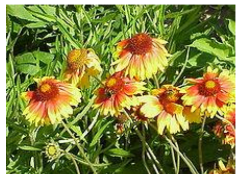
Gaillardia aristata Blanket Flower