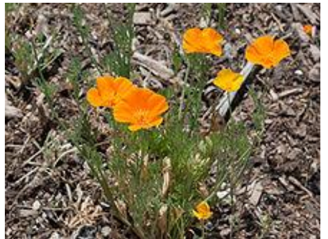
Eschscholtzia californica Californian poppy