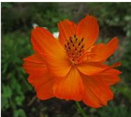
Cosmos sulphureus Sulphur Cosmos