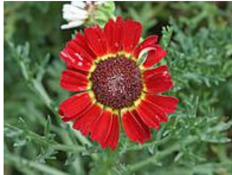
Chrysanthemum carinatum Chrysanthemum