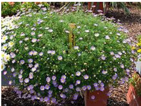
Brachyscome iberidifolia Swan River daisy