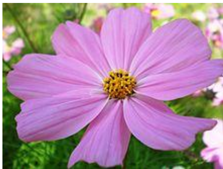
Cosmos bipinnatus Cosmos