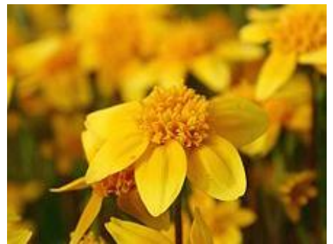
Lasthenia Californica California goldfields