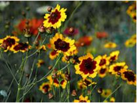
Coreopsis tinctoria Plains Coreopsis