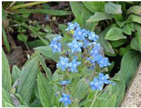
Cynoglossum amabile Chinese forget-me-not