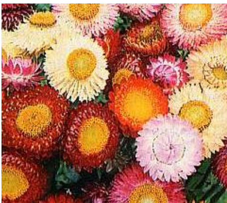
Helichrysum monstrosum Dwarf everlasting flower