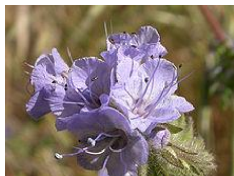
Phacelia Tanacetifolia Lacy phacelia