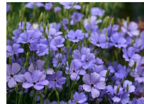
Viscaria occulta Blue angel