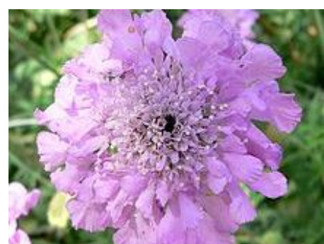
Scabiosa columbaria Scabious