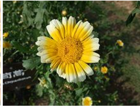
Chrysanthemum segetum Corn marigold