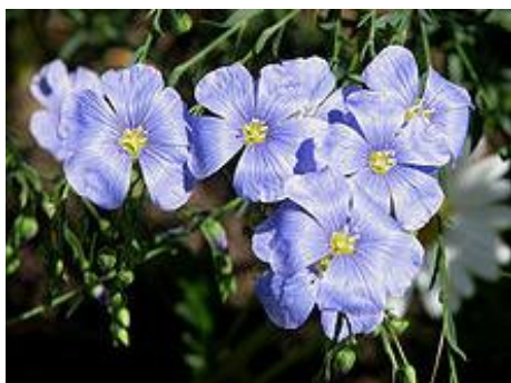
Linum usitatissimum Blue flax