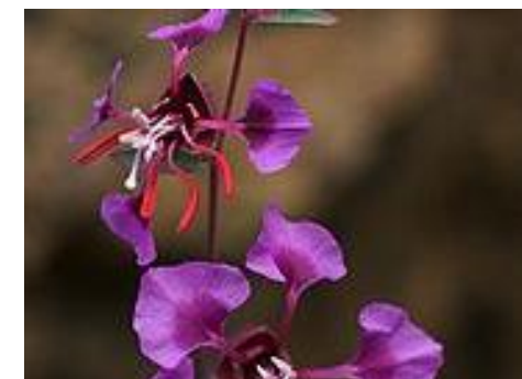
Clarkia unguiculata Mountain Garland