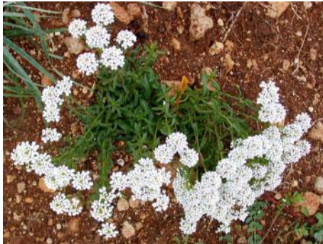
Iberis amara Dwarf candytuft