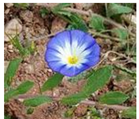
Convolvulus tricolor Morning glory