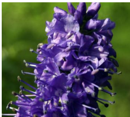
Delphinium consolida Larkspur