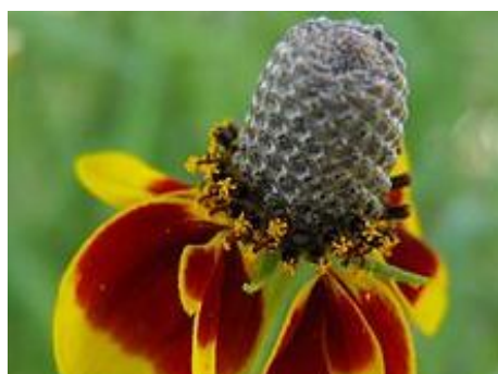
Ratibida columnifera Prairie coneflowers