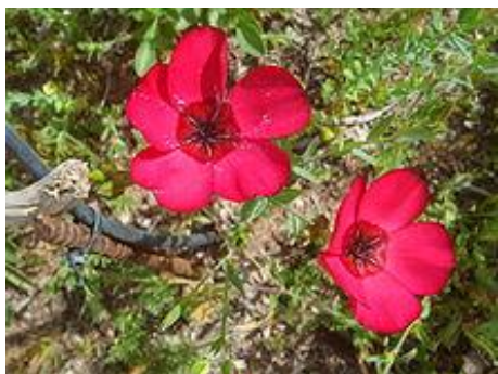
Linum grandiflorum Scarlet flax