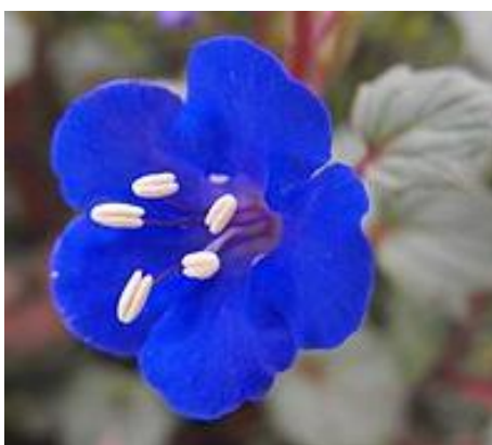
Phacelia Campanularia California bluebell