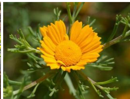
Cladanthus arabicus Palm Springs daisy