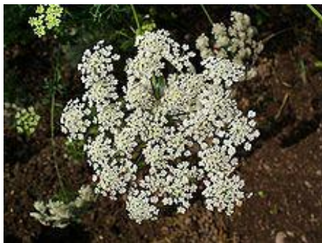
Ammi majus Queen Anne's lace