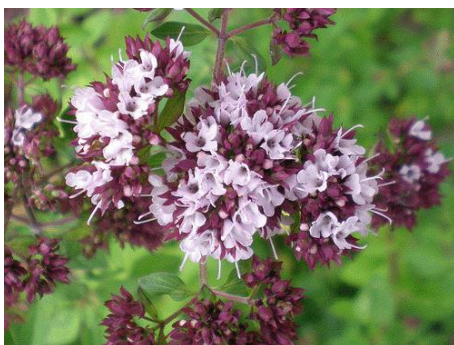
Origanum majorana Origano