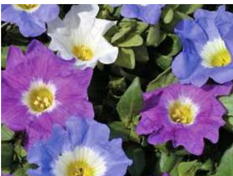
Nolana paradoxa Wild bird