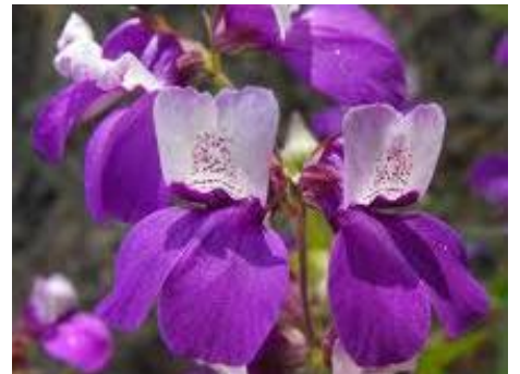
Collinsia bicolor Chinese houses