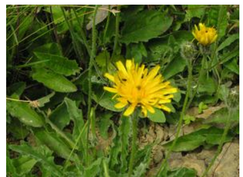
Leontodon hispidus Rough hawkbit