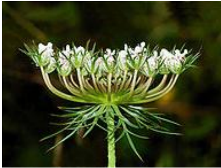
Daucus carota Wild carrot