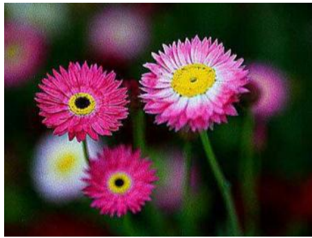
Helipterum roseum Paper flower