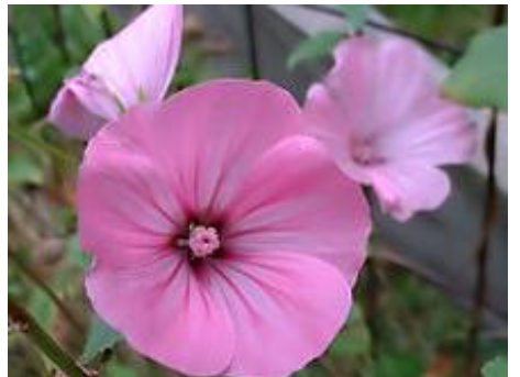
Lavatera Trimestris Rose mallow