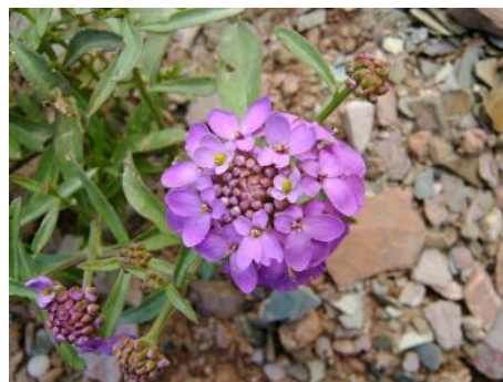
Iberis umbellata Candytuft