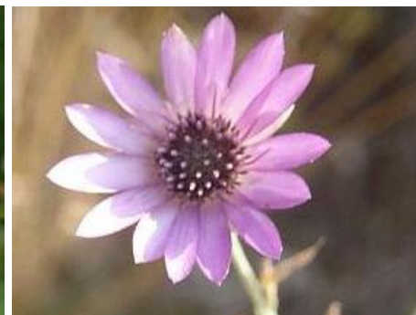
Xeranthemum annuum Everlasting flower