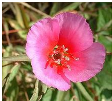
Clarkia amoena Farewell to spring