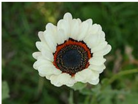
Venidium fastuosum Cape daisy