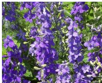
Delphinium ajacis Wild delphinium