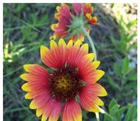
Gaillardia pulchella Indian blanket