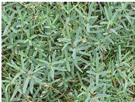
Gypsophila muralis Baby's breath