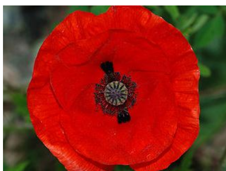
Papaver rhoeas Poppy