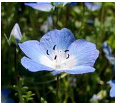
Nemophila menziesii Baby blue eyes