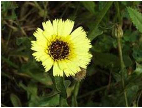
Tolpis barbata Umbrella milkwort