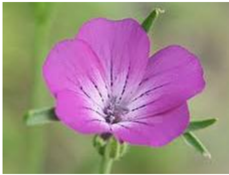
Agrostemma githago Corncockle